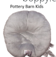
Pottery Barn Kids